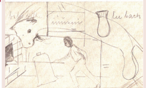
Fall 17: Schizophrene Klangassoziationen.